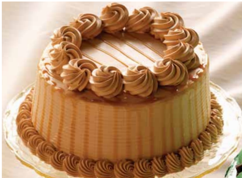
DULCE DE LECHE