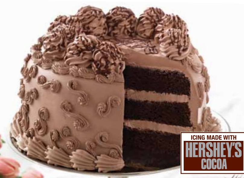
CHOCOLATE WITH HERSHEY'S COCOA