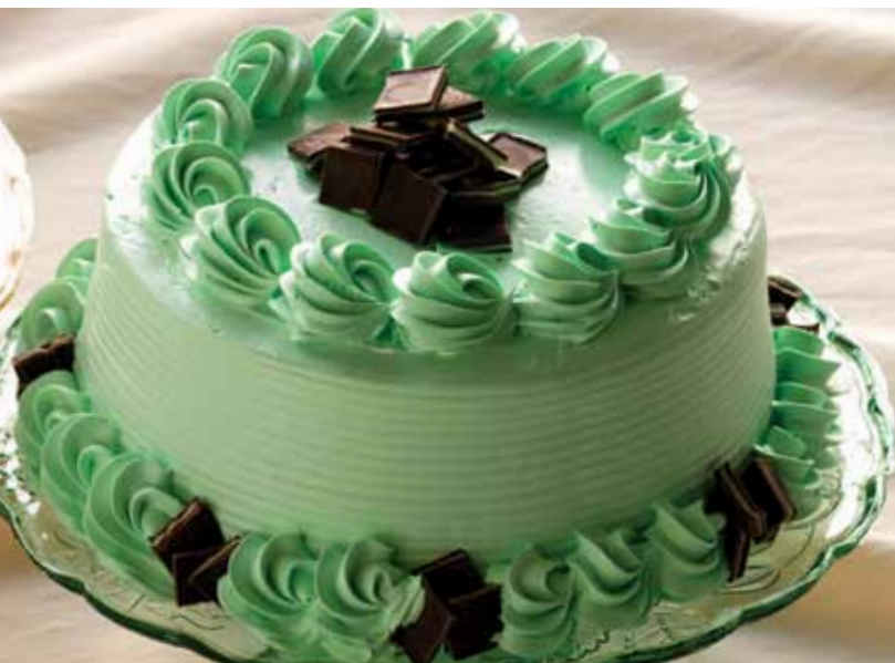
CRÈME DE MENTHE